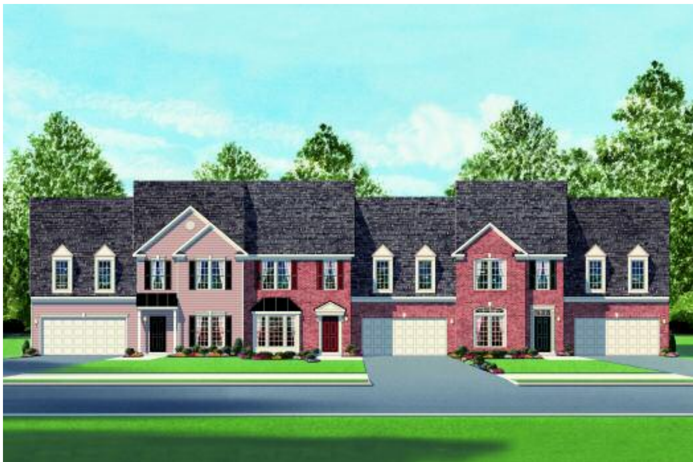
LEVEL ENTRY WITH GARAGE